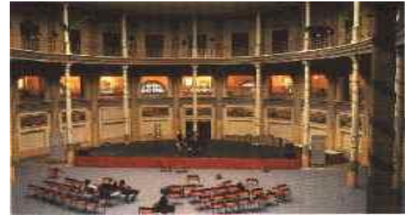
Casa dell'Architettura - Acquario Romano Piazza Manfredo Fanti, 47

Before the dinner a guided tour to the Domus Romane in Palazzo Valentini will be organised.