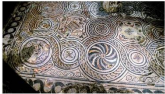
Domus Romane - Palazzo Valentini (detail) Via Foro Traiano, 85

Before the dinner a guided tour to the Domus Romane in Palazzo Valentini will be organised.