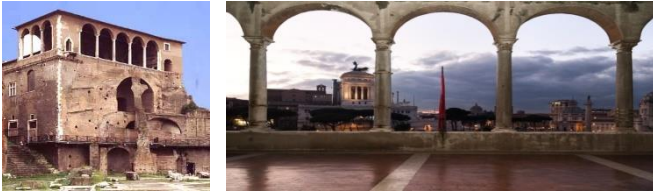
Casa dei Cavalieri di Rodi Piazza del Grillo, 1

On the 12 th of June all conference participants are welcomed to a gala dinner in a unique location, the terrace of the Casa dei Cavalieri di Rodi , located in the Foro di Augusto.